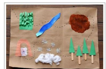
We're Going on a Bear Hunt MAP & BINOCULARS